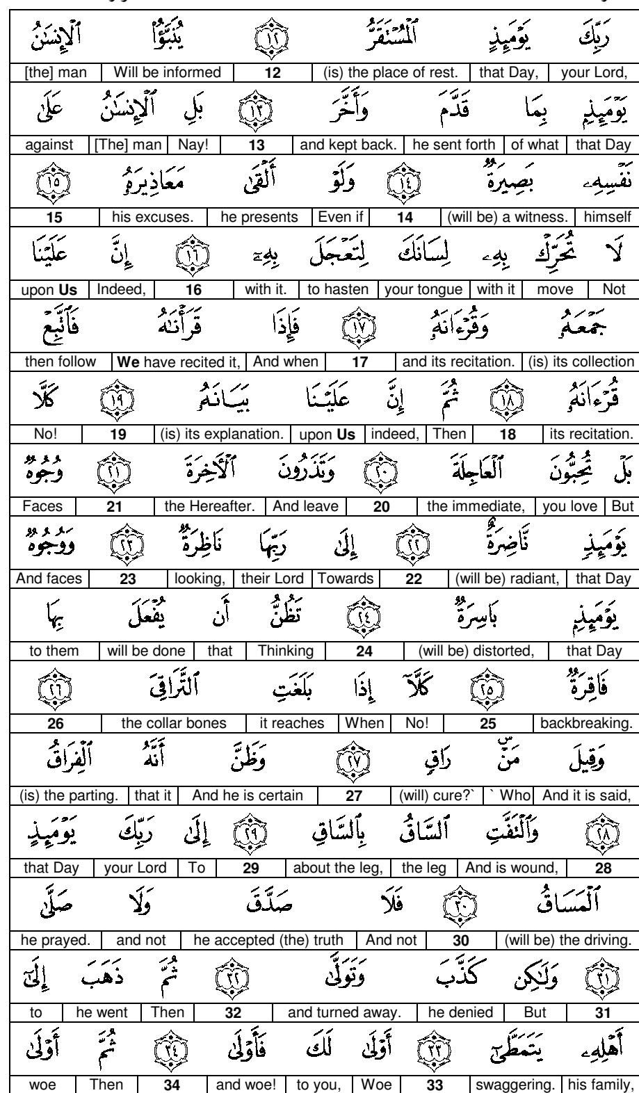
Surah 75: The Resurrection (v. 13-35)