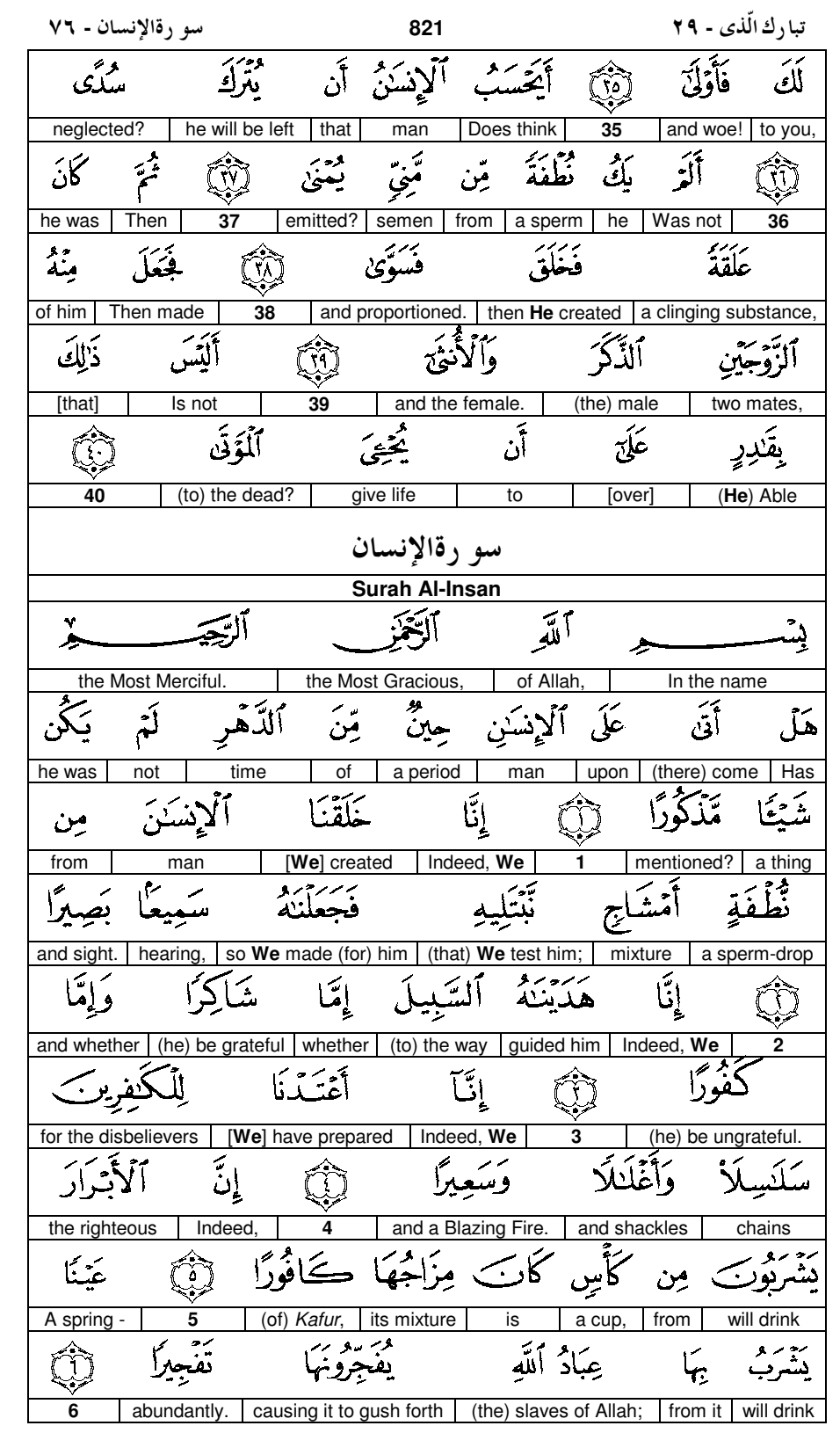
Surah 76: The man (v. 1-6)